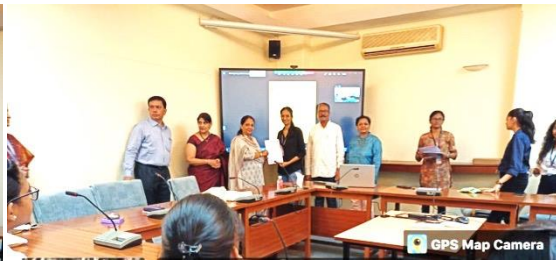
Guests were presented plant saplings